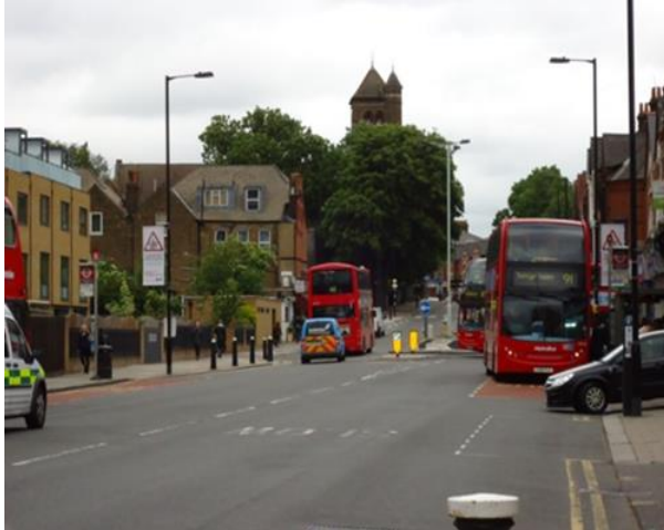
The same view along Tottenham Lane looking towards Holy Innocents' as it