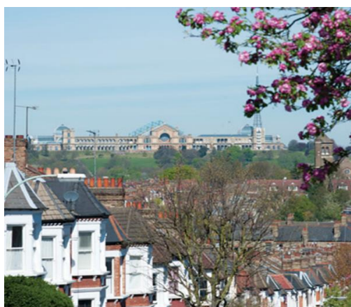
View of Alexandra Palace

We hope Holy Innocents' Hornsey appeals to you!