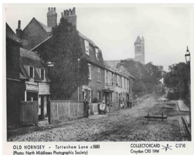
Tottenham Lane showing Holy Innocents' in 1880, three years after our church was built.

The most recent National Census taken in 2011 describes the parish as an area where the 19 - 65 age group are the main population, and with a diverse ethnicity. African, European and Caribbean are the predominate ethnic communities. The main non-English languages spoken are Eastern European. It is an area where professional and people in the entertainment profession are the two highest employment categories, and it is not considered to be an area of high deprivation. The Census information is attached at Annex A to this profile.