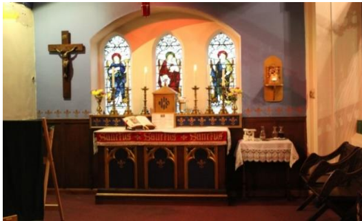
Our Lady Chapel