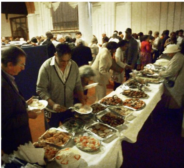
A typical table of HI delights for a special occasion

Holy Innocents' is known for its delicious bring & share suppers when celebrating special events. A full array of Caribbean and other international cuisine is always on offer for such occasions.