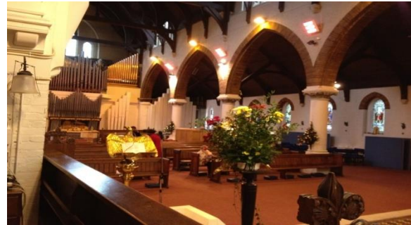
Looking westward towards our organ