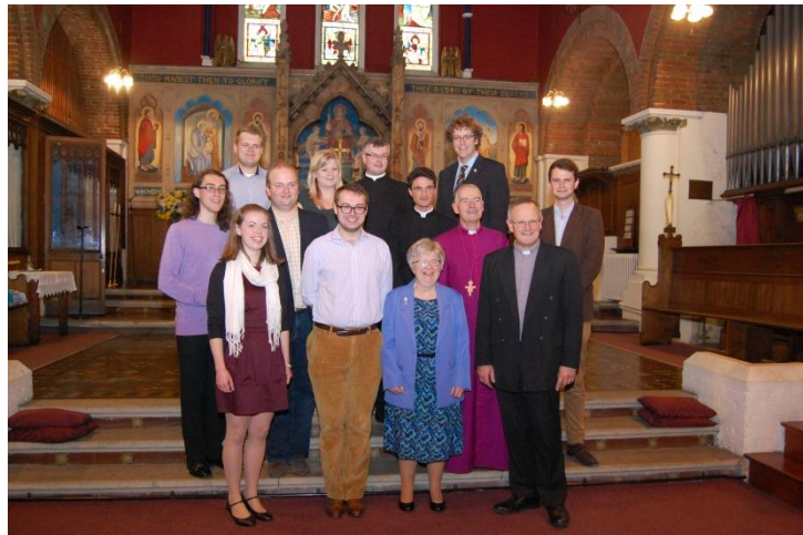
Some of our past pastoral assistants with clergy and our LLM

We have been part of the North London Pastoral Assistants' Scheme since September 2010 and we are very keen to continue to be part of the Scheme as we see it as an essential part of our mission for the wider church, in keeping with 'Capital Vision'.