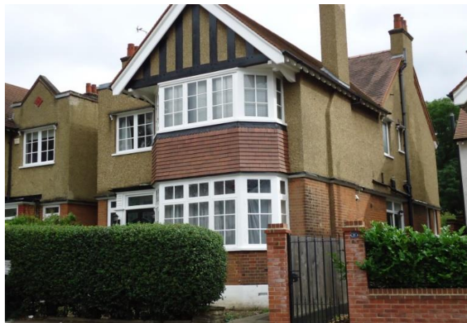
Our vicarage at 99 Hillfield Avenue

The vicarage is a spacious and comfortable family house conveniently situated just around the corner from the church. The house has three reception rooms, one of which is suitable as an office/study, four bedrooms and a conservatory looking out onto the back garden. There is also a garage situated at the end of the drive in the church grounds. It was bought by the Diocese in 1995 to replace our original vicarage. The Vicarage is within walking distance to five primary schools, three secondary schools, a myriad of coffee shops, bars, eateries, gyms, boutique shops and high street supermarkets. And all this is coupled with two new state of the art independent cinemas on the doorstep and the green spaces of Priory Park, Queens Wood and Highgate Wood, and Alexander Palace all within a healthy walk or bike