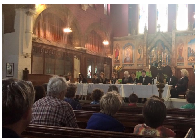
The Crouch End Players performing one of their Radio Plays in Holy Innocents as part of the Crouch End Festival

The Festival line-up which includes performances from the Crouch End Players, visiting choirs and artists, presents a wonderful opportunity to throw open the doors and invite lots of new people to come inside and experience Holy Innocents'.