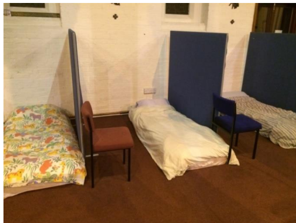
Shelter and Safety