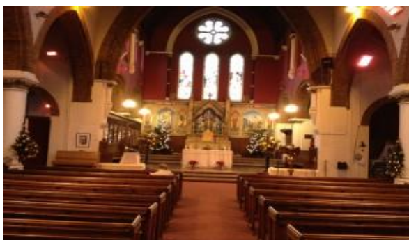
Looking eastward towards the High Altar

Following our Quinquennial Inspection in 2013, we addressed essential maintenance and repairs to the fabric church to ensure full compliance with fire, and health and safety regulations. Cracking to outer walls of the sacristy and boundary wall was subject to a period of monitoring following the removal of trees/shrubs. A full schedule of repairs to the sacristy will be undertaken during 2017 whilst the matter of repairs to the boundary wall is currently under negotiation with the neighbouring landlords. We anticipate resolution of the latter during the Spring of 2017.